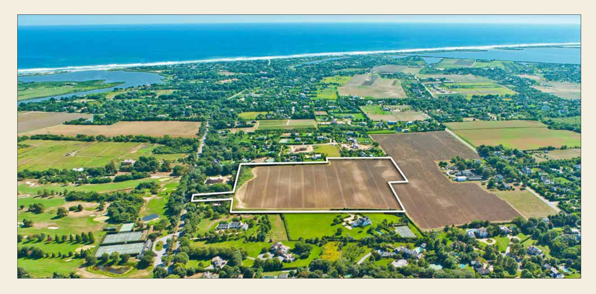
This property is one of the last large tracts of land left south of the highway in Bridgehampton. The 20-acre parcel is a flag lot and offers privacy and expansive views in one of the most sought after locations.